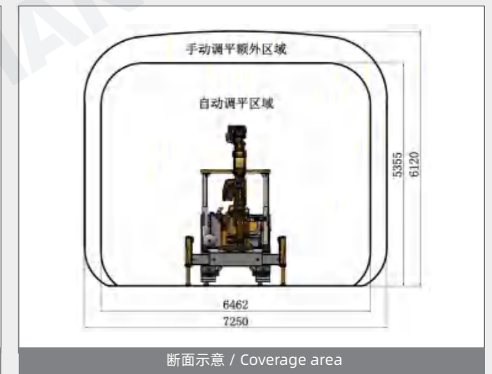
断面示意 / Coverage area